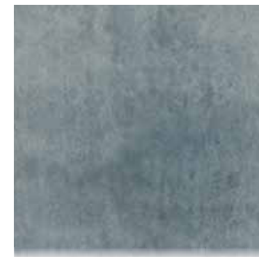
NS-534 Cadet Blue