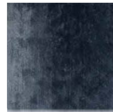
NS-681 Black Light