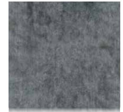
NS-520 Slate Blue