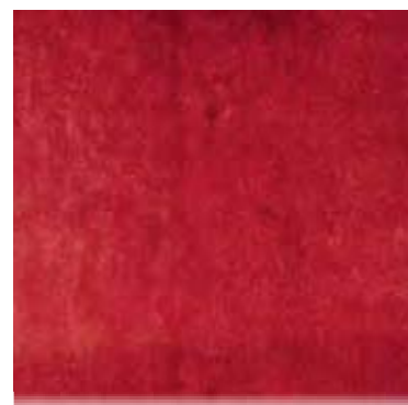
NS-259 Poppy Red