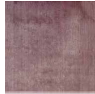
NS-621 Blue Hydrangea