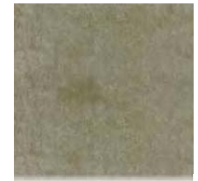
NS-433 Sage Green