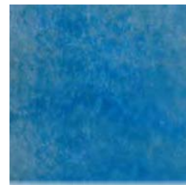
NS-511I Cornflower Blue Not for Outdoor Use