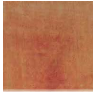
NS-107 Dark Buff