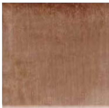
NS-131 Milk Chocolate