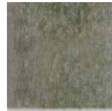
NS-442 Mystic Green