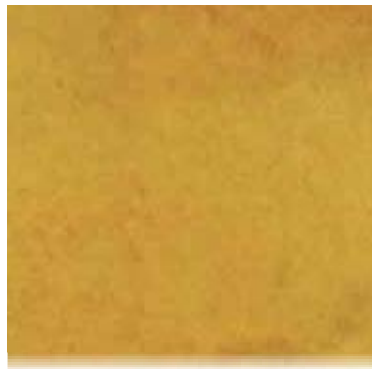
NS-321 Lemon Grass