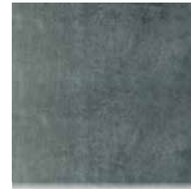
NS-519 Seal Gray